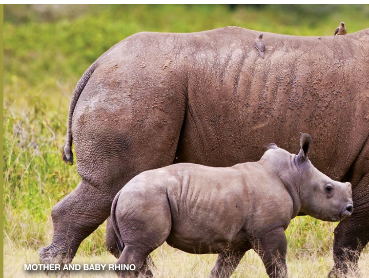
MOTHER AND BABY RHINO